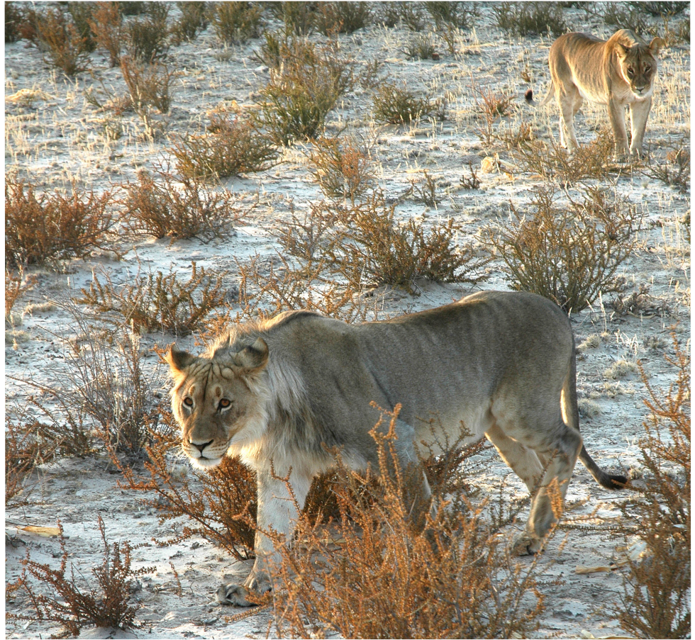
Young, hungry lions here investigate the scent of meat on the wind. Lions hunt mainly by sight.

Following the rails, departing coolies and their kit no longer ringed the hospital a short mile from Patterson's tent. Though a stout boma encircled that