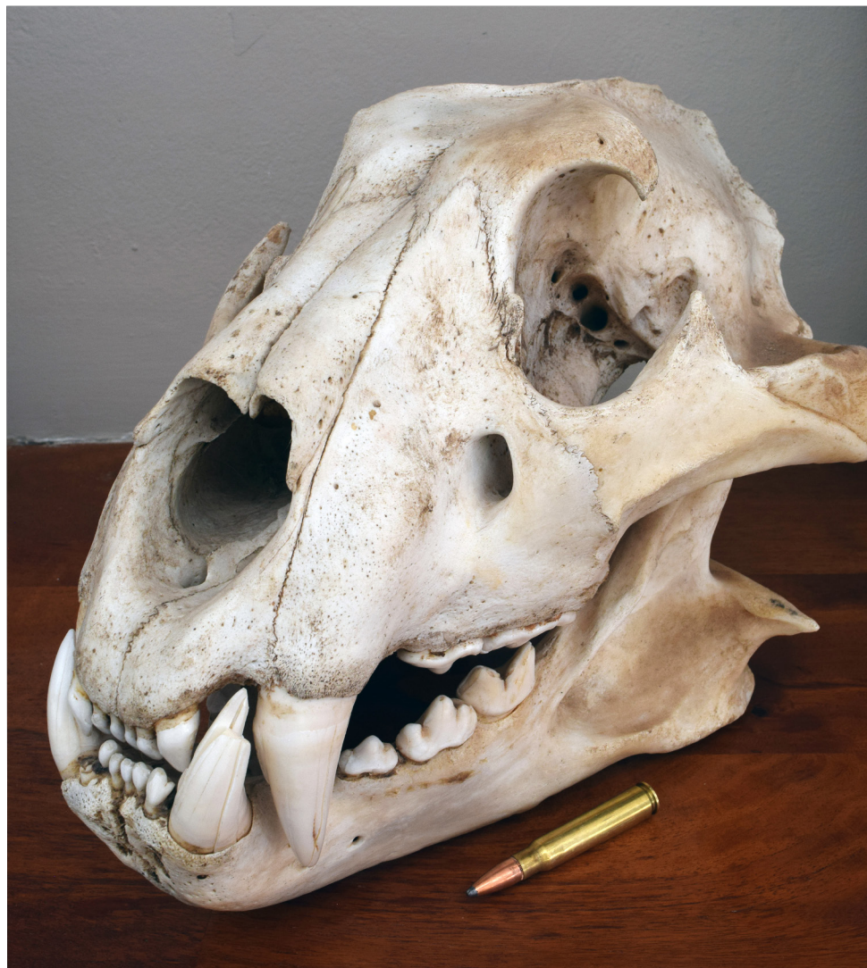
A big lion's skull and "tusks" dwarf an 8x57 cartridge, Germany's do-it-all round for a century.

advanced, pushing "a huge maneless lion" into his sights. "As I covered his brain with my rifle, I felt that at last I had him...."