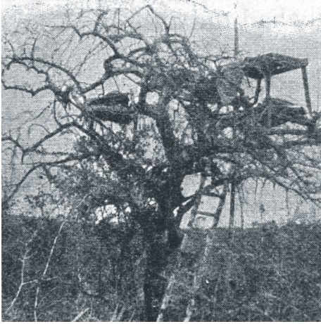
Perched in this low, rickety machan on a dark African night, Patterson knew he was man-eater prey.

Fourteen coolies awakened by a lion that tore into their shelter froze in terror as the beast grabbed a bag of rice and bounded off. An Indian trader, traveling at night astride a donkey also laden with empty oil tins, was attacked by a lion whose leap flattened both man and mount. But when its scimitar claws caught ropes tethering the tins, the startled cat dashed off, clattering cans in its wake.